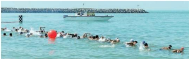
Competitors at the start line of their 10km race at the 17th GCC Open Water Swimming Championships in Kuwait on Friday.

Kulaibi wins gold at the 17th GCC Open Water Swimming Championships