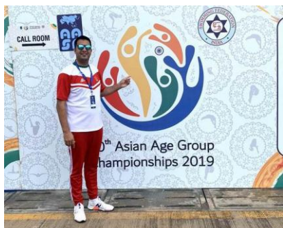
As a Head Coach of the Oman Swimming Team at the 10th Asian Age Group Championships 2019 in Bengaluru, India