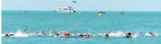
Swimmers take part in the 10km race at the 17th GCC Open Water Championships in Kuwait on Saturday.

Oman swimmers return with rich haul of eight medals including five gold