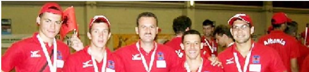
Albanian Men's Swimming Team at the Mediterranean Games - Pescara 2009

This article focuses primarily on the distinguishment of the swimmers and their participation for the "Kuq e Zi" in international swimming tournaments.