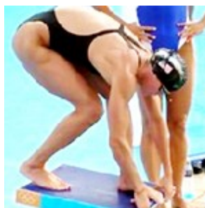
Rovena Marku, 2008 Beijing Olympics