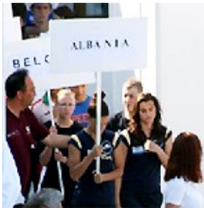
Rome 2009, opening...